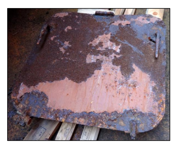
Figure 4: Material wastage signs and failed of hinges

It was clear to the safety investigation that the hinges and stopper failed while the stevedore was climbing his way up from the cargo hold. Moreover, the most logical sequence of events was for the stopper pin to fracture first, followed by the hinges (unless the hinges had already corroded away prior to the accident).