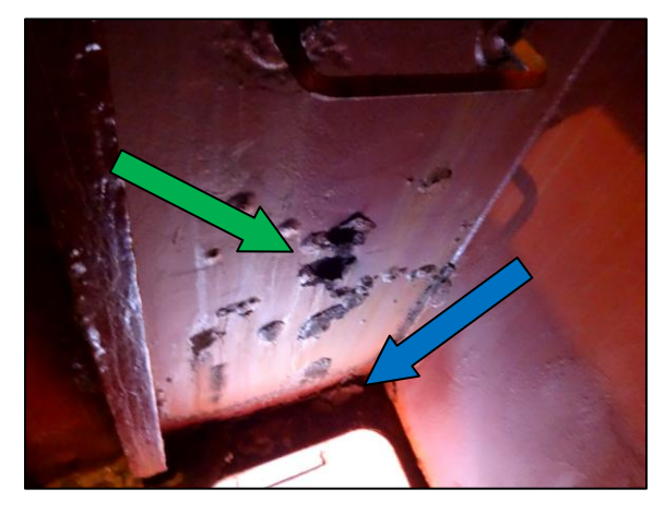
Figure 2: Broken stopper (green arrow) and broken hinges (blue arrow)

An inspection of the cargo hold access cover indicated it was also designed to help a person climb the vertical ladder. A stopper pin was fitted to keep the cargo hold access cover secured and in a vertical and open position. The MSIU found that the cargo hold access cover's stopper pin had been totally dislodged and the hinges had failed (Figure 2), in all probability while the stevedore was climbing out of cargo hold no. 2^5 .