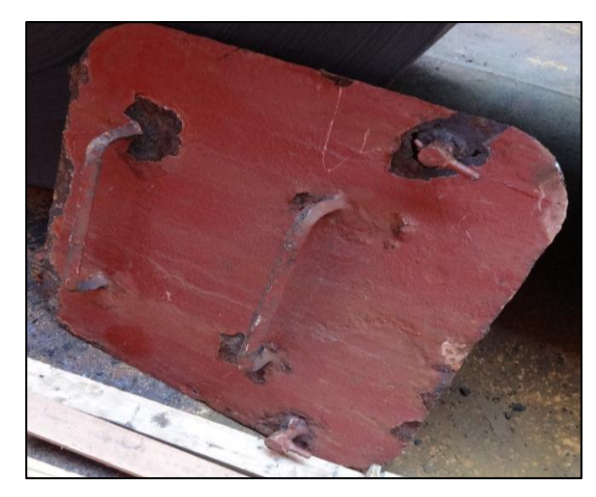
Figure 3: Cargo hold access cover as found at the bottom of the cargo hold.

The cargo hold access cover had signs of general corrosion. Material wastage was evident, suggesting that it had not been maintained over the months prior to the accident (Figure 3).