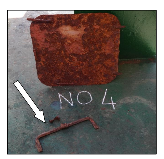
Figure 7: Broken stopper

Considering that the use was very limited and taking into consideration that there was no thorough knowledge of the physical condition of the grain hatch cover, the safety