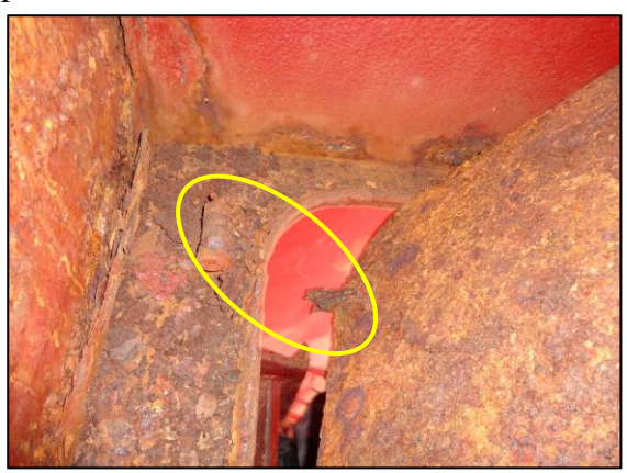
Figure 6: Broken hinge

Taking into consideration the condition of all the inspected cargo hold access covers, the safety investigation concluded that the covers had not been thoroughly inspected as part of a maintenance regime applied on board and may have even been missed, given that they were rarely used and always kept in the open position.