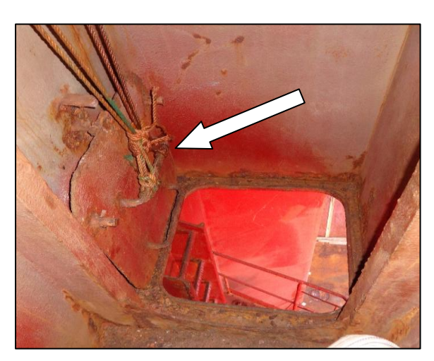
Figure 5: Cargo hold access cover in way of cargo hold no. 4

An additional cargo hold access cover was inspected during the course of evidence collection on board. The cargo hold access cover fitted in cargo hold no. 4 was found in a similar (poor) condition to that in cargo hold no. 2 (Figure 5).