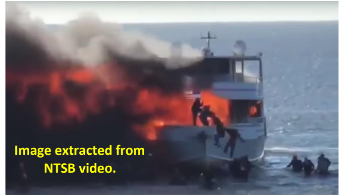
Image extracted from NTSB video.

Last year, a Coast Guard inspected vessel operating as a shuttle to transport passengers to and from an offshore casino vessel suffered a devastating fire not long after the vessel got underway from the dock. Within minutes of observing that one of the vessel's engines was overheating and a significant amount of smoke emanating from the vessel, the master altered course and quickly grounded the vessel in shallow water. Passengers were then able to evacuate the vessel and wade ashore. Several persons were injured and there was one resultant fatality.